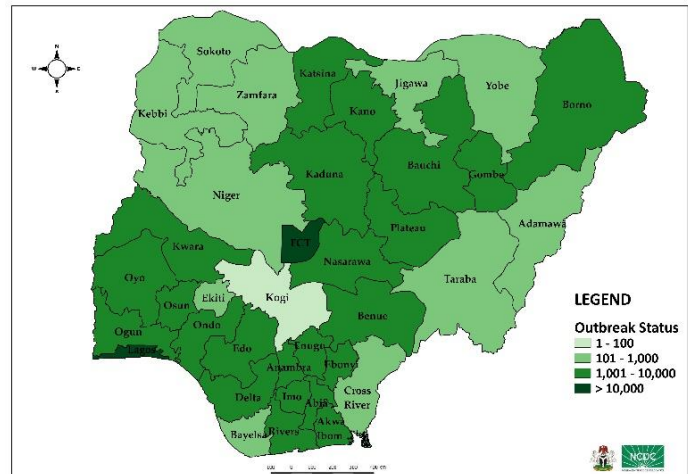
Fig 2. Distribution of cumulative cases